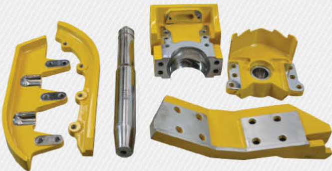
Track Roller Frame Group Parts