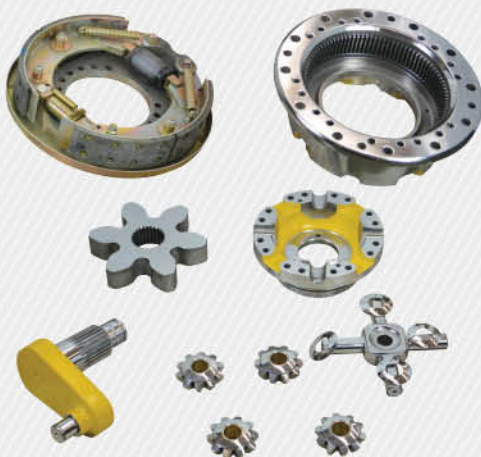
Brake Group Parts and Differential Parts