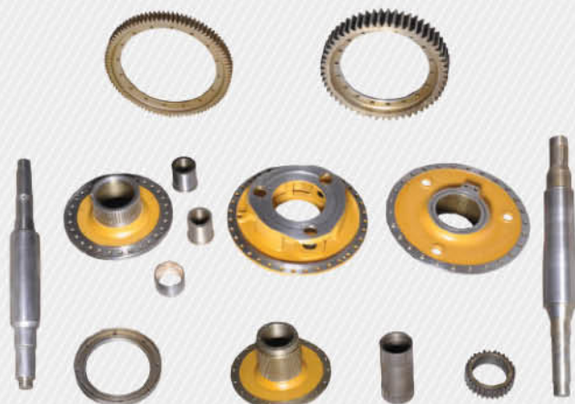
Final Drive Gear Shaft and Sprocket