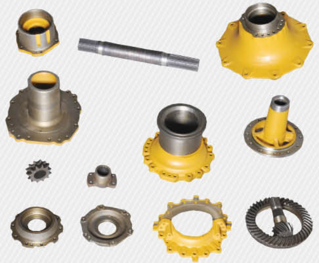
Final Drive Parts