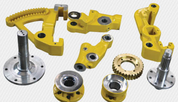
Motor Grader Circle Group Parts