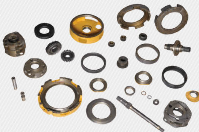
Planetary Transmission Parts