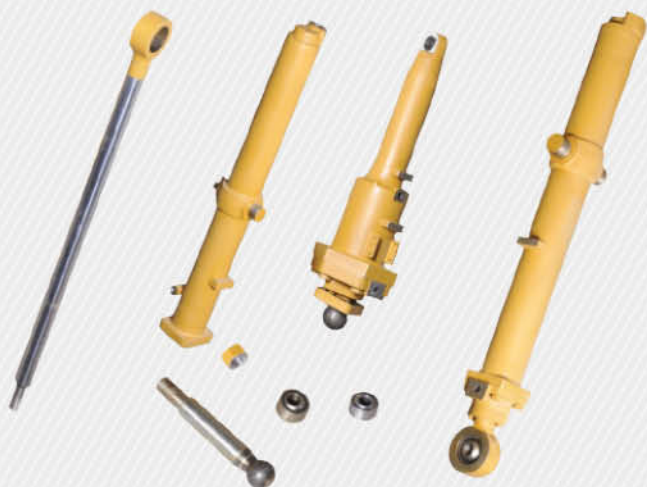
Blade Lift Cylinder and Brackets