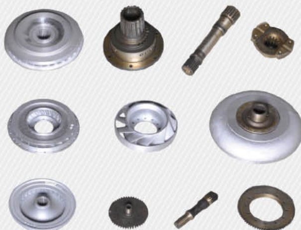
Torque Converter Parts