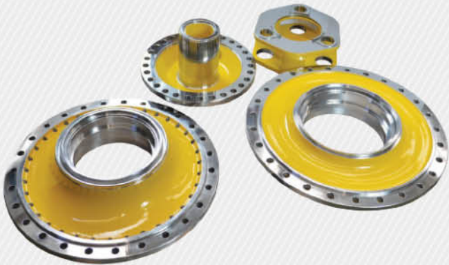
Dozer Final Drive Boss Sprocket and Hubs