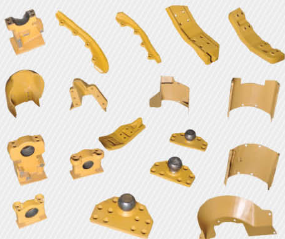
Track Frame Parts Cover and Guard