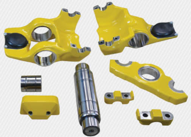
Track Frame and Bogie Parts